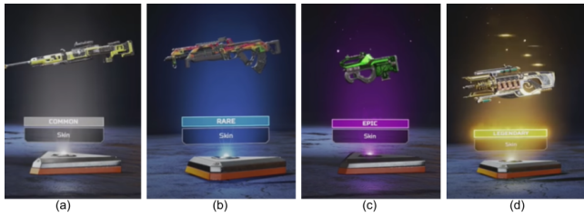
Figure 3: Rewards in the form of gun skins from opening packs in the game Apex Legends have different associated colours and effects depending on their rarity - (a) a common (gray), (b) rare (blue), (c) epic (purple), and (d) legendary (gold) gun skin.

typically responded with displeasure, e.g. “if I get something [not as good] I feel worse” (P6), or apathy, e.g. “oh well, unlucky” (P3). A greater disparity in reward value and presentation tended to induce stronger negative emotions for users when receiving lower-valued rewards. Despite this, users still showed a preference for having different values of rarities clearly displayed, with the common sentiment being that the elation of infrequently receiving rare rewards heavily outweighed the disappointment or apathy of getting many non-rare ones.