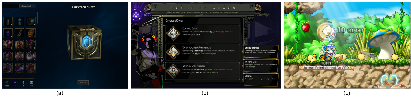
Figure 1: Screenshots of RRM systems in popular video games: (a) Loot box system (Hextech Chests) in League of Legends (image © Riot Games); (b) Power-up system (Boons system) in Hades (image © Supergiant Games); (c) Randomized loot drop in Maplestory (image © Nexon).

Robert Xiao University of British Columbia Vancouver, BC, Canada brx@cs.ubc.ca